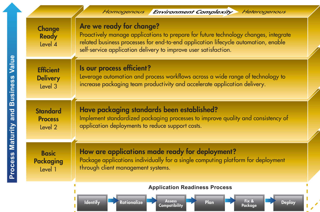
Figure 2: Application Readiness Maturity Model helps chart a path to higher levels of business value.